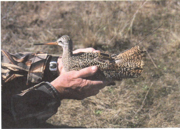
Figure 1. A 326 gram male Marbled Godwit being fitted with solar-powered transmitter on Akimiski Island on 6 June 2007.